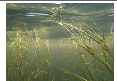
Widgeongrass in Miles River