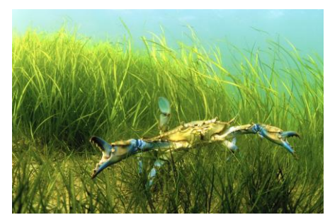
Blue crab in Eelgrass, by Jay Fleming

Incorporating the protection of SAV into project design does not necessarily require additional or substantial investments. Best management practices (BMPs) that are designed to improve water quality and achieve the Chesapeake Bay TMDL will also protect SAV. The chart below highlights current BMPs that experts have rated based on the value a BMP provides to several Chesapeake Bay Program (CBP) outcomes. Comparing across multiple CBP outcomes demonstrates how a BMP can provide co-benefits to more than one outcome. However, case-by-case evaluation of co-benefits is recommended. Nutrient management plans, wetland and streamside wetland restoration,