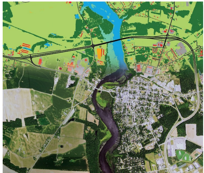
Aerial imagery of Denton, Maryland, is overlaid with data from the Chesapeake Bay High Resolution Land Cover Project. The data, newly included in the Watershed Model, delivers 900 times more information than existing data, showing land cover such as tree canopy (represented in dark green), buildings (represented in red) and roads (represented in black).

The Phase 6 Suite of Modeling Tools can also simulate the environmental impacts of population growth, climate change and sediment build-up behind the Conowingo Dam (on the Susquehanna River in Maryland), which helps decision makers explore options for addressing these factors.