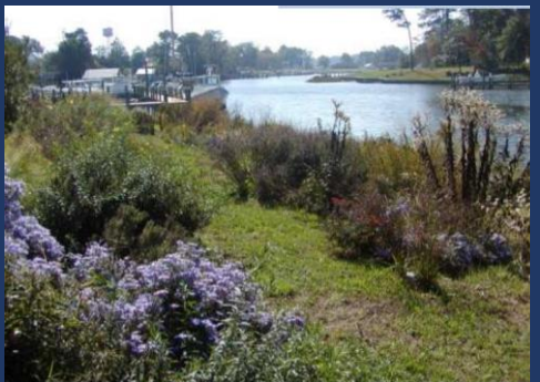
Reedville VA Living Shoreline.