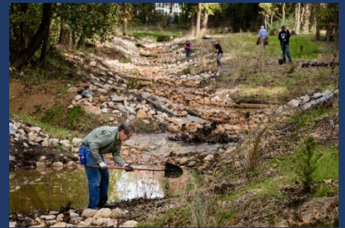
Tree Planting at Stream Restoration Site in Annapolis, MD

BMPs are designed to improve water quality and achieve the Chesapeake Bay TMDL, however many of these same measures have the potential to enhance fish habitat as well. With deliberate planning, you can maximize your water quality investment by implementing practices that result in the improvement of fish habitat and increased value of natural resources. Experts utilized their best professional judgement to appraise the benefit or detriment to natural resources from 143 different BMPs. A snapshot of this review is captured in the table below, focusing on the BMPs that were scored as having a positive impact on fish habitat of 3.5 or higher, on a scale of -5 to +5. The additional columns include natural resources that benefit from the selected BMPs. While this table provides a helpful estimate of the additional ecosystem value generated by these BMPs, it is recommended to conduct a case-by-case evaluation of co-benefits for individual sites.